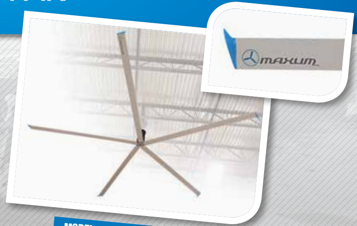
MODEL 26' (8,0m)